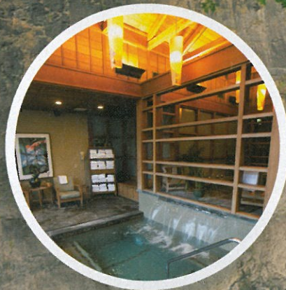
Snoqualmie Falls and the Salish Lodge & Spa with Mt. Si in the distant background.

SLEEPING NEXT TO A WATERFALL WHERE THE SPIRITUAL MIST ENLIGHTENS YOUR DREAMS BRINGS NEW INSIGHT.