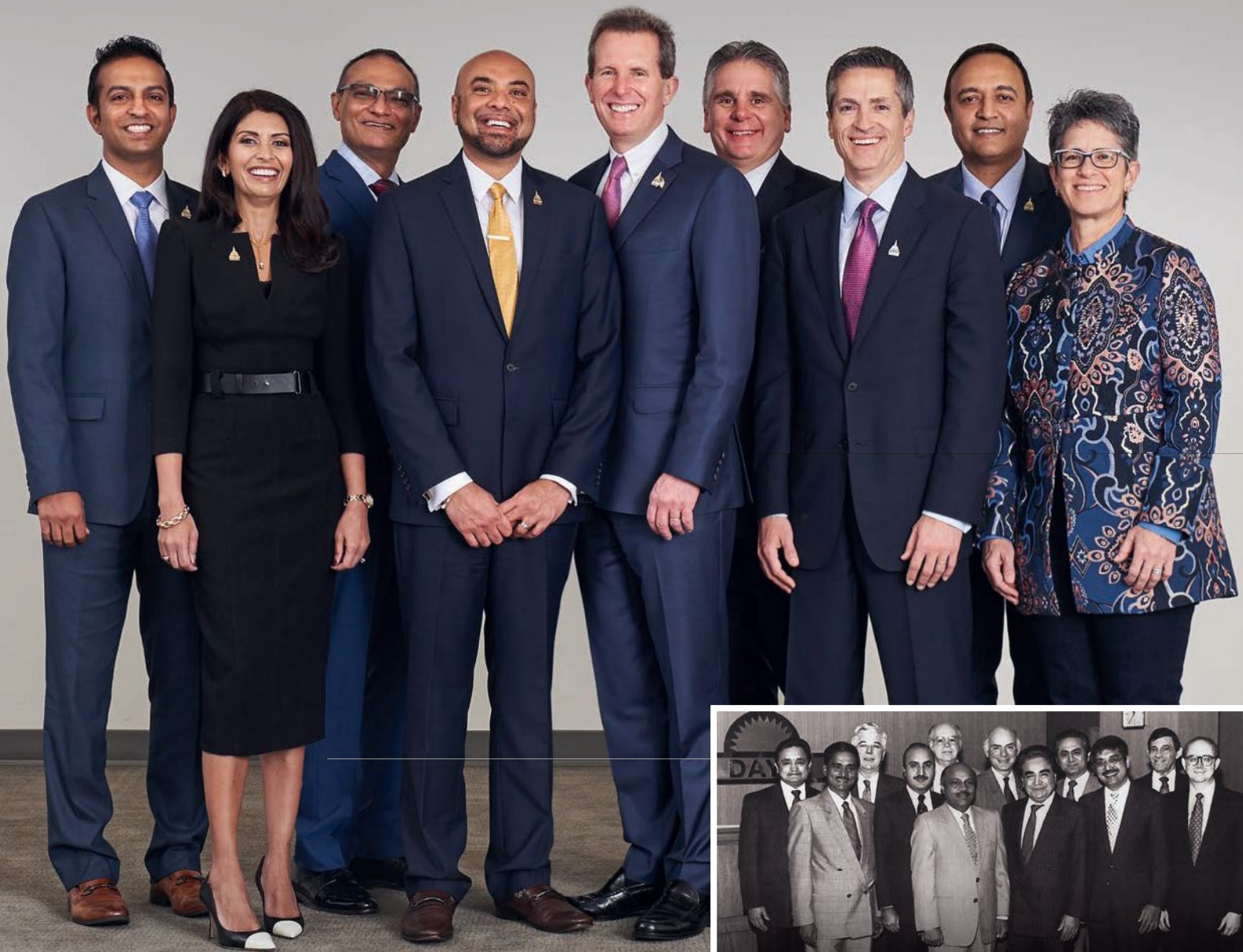
AAHOA Officers with Wyndham Hotels & Resorts Leadership, 2019

A lot has changed in 30 years and our partnership remains strong.